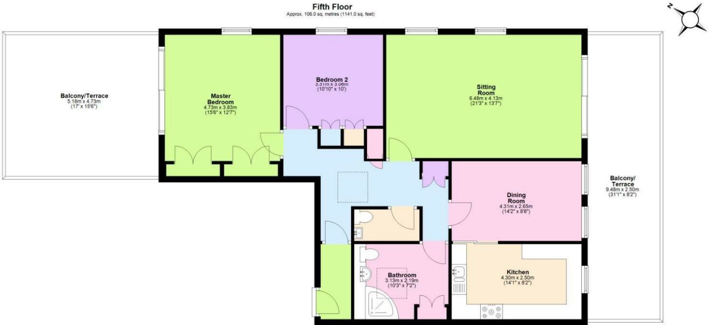
Total area: approx. 106.0 sq. metres (1141.0 sq. feet) 35 St Kenya Court, Keynsham